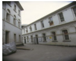
treasury reserve precinct spring street st andrews place & treasury place side elevation paper store 1997