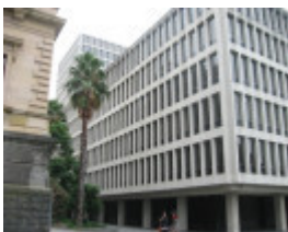
State Government Offices Treasury Precinct, April 2012.JPG