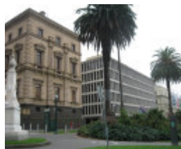
State Government Offices Treasury Precinct, April 2012.JPG