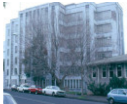
Treasury Reserve Precinct 17 St Andrews