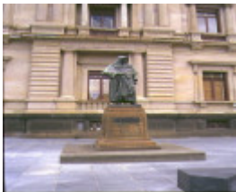
treasury reserve precinct spring street st andrews place & treasury place highbotham statue mar1999