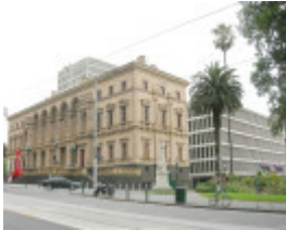
TREASURY RESERVE PRECINCT SOHE 2008