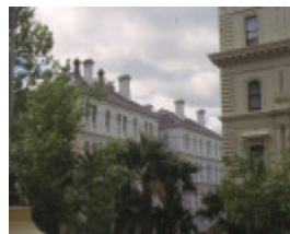
treasury reserve precinct spring street st andrews precinct view mar1999