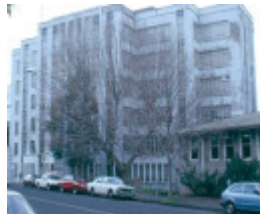
Treasury Reserve Precinct 17 St Andrews