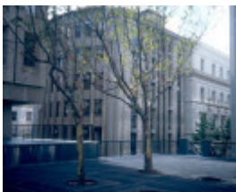
Treasury Reserve Precinct Western Annex Demolished