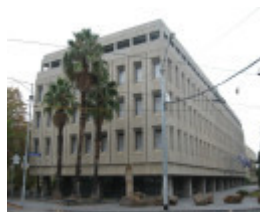
Former State Chemical Laboratoires Treasury Precinct, April 2012.JPG