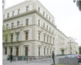
TREASURY RESERVE PRECINCT SOHE 2008