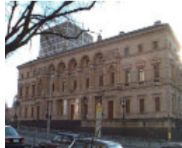
treasury reserve precinct spring street st andrews place & treasury place view from spring street