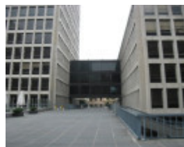
State Government Offices Treasury Precinct, April 2012.JPG