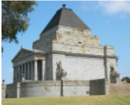
SHRINE OF REMEMBRANCE SOHE 2008