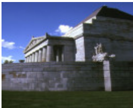
shrine of remembrance st kilda road melbourne side elevation