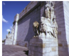
shrine of remembrance st kilda road melbourne side view with lions