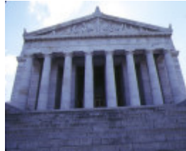
shrine of remembrance st kilda road melbourne front view of columns