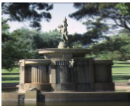
shrine of remembrance st kilda road melbourne macrobertson fountain nov1990