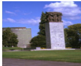
shrine of remembrance st kilda road melbourne ww2 memorial