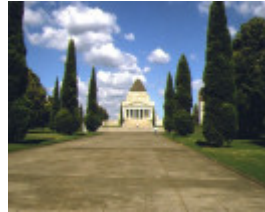
1 shrine of remembrance st kilda road melbourne front view