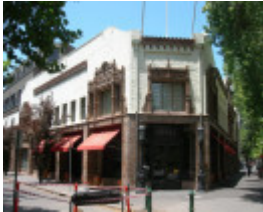
FORMER KELLOW FALKINER SHOWROOMS SOHE 2008