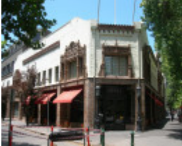
FORMER KELLOW FALKINER SHOWROOMS SOHE 2008