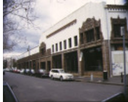
1 former kellow falkiner showrooms st kilda road melbourne front view