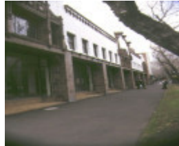
former kellow falkiner showrooms st kilda road melbourne street view