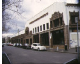
1 former kellow falkiner showrooms st kilda road melbourne front view