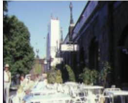
1 princes walk vaults batman avenue melbourne cafes on walk feb1985