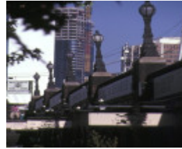
princes walk vaults batman avenue melbourne cast iron lights feb1985