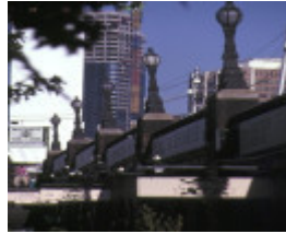
princes walk vaults batman avenue melbourne cast iron lights feb1985