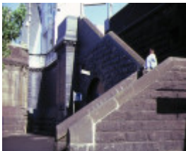
princes walk vaults batman avenue melbourne stairway feb1985