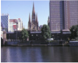
princes walk vaults batman avenue melbourne view from across yarra feb1985