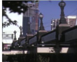
princes walk vaults batman avenue melbourne cast iron lights feb1985