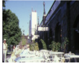
1 princes walk vaults batman avenue melbourne cafes on walk feb1985