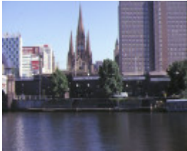
princes walk vaults batman avenue melbourne view from across yarra feb1985