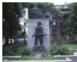
state library of victoria & national museum complex war statue on la trobe street corner jan1985