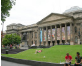
STATE LIBRARY OF VICTORIA SOHE 2008