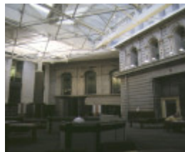
state library of victoria & national museum complex covered courtyard feb1998