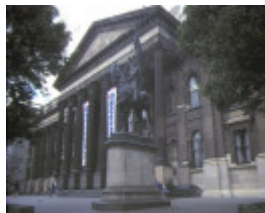
State Library of Victoria and Museums Complex, 1985, showing building facade with the statue of St Joan of Arc in the foreground