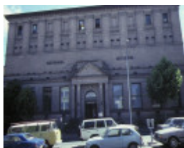
state library of victoria & national museum complex museum entrance russell street jan1985