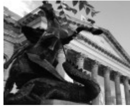
STATE LIBRARY OF VICTORIA July 2016