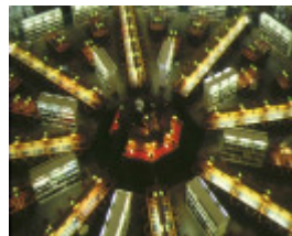
state library of victoria & national museum complex domed reading room feb1998