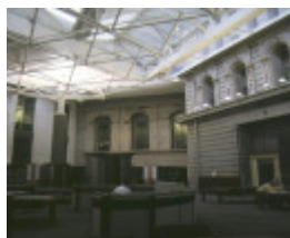
state library of victoria & national museum complex covered courtyard feb1998