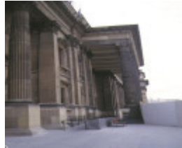
1 state library of victoria & national museum complex entrance feb1998