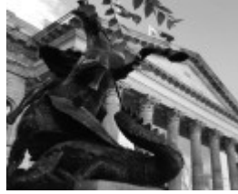
STATE LIBRARY OF VICTORIA July 2016