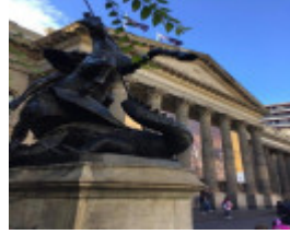
STATE LIBRARY OF VICTORIA July 2016