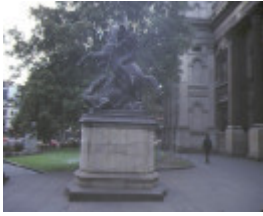
state library of victoria & national museum complex statue of st george & the dragon jan 1985