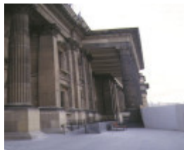
1 state library of victoria & national museum complex entrance feb1998