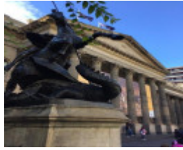
STATE LIBRARY OF VICTORIA July 2016