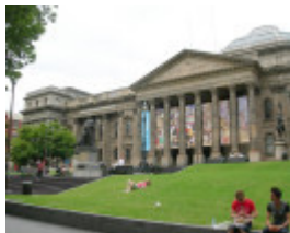
STATE LIBRARY OF VICTORIA SOHE 2008