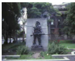
state library of victoria & national museum complex war statue on la trobe street corner jan1985