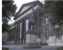
State Library of Victoria and Museums Complex, 1985, showing building facade with the statue of St Joan of Arc in the foreground