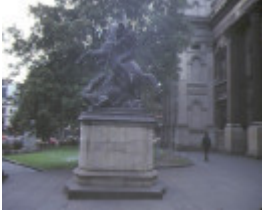
state library of victoria & national museum complex statue of st george & the dragon jan 1985