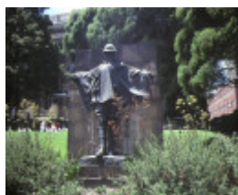
state library of victoria & national museum complex war statue jan1985