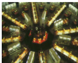
state library of victoria & national museum complex domed reading room feb1998