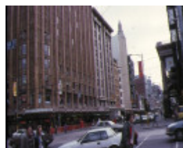
capitol house swanston street melbourne street view