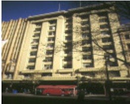
1 capitol house swanston street melbourne front elevation jun1997