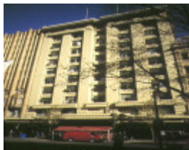
1 capitol house swanston street melbourne front elevation jun1997