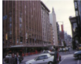
capitol house swanston street melbourne street view