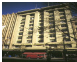
1 capitol house swanston street melbourne front elevation jun1997