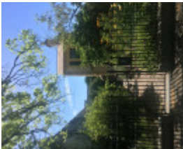
896-898 Swanston St 3