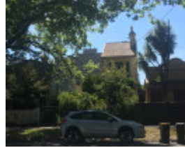
896-898 Swanston St 1