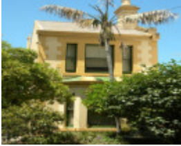
BUILDING SOHE 2008