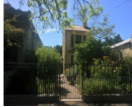
896-898 Swanston St 2