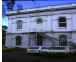
Royal Society Of Victoria Victoria Street Melbourne Rear View Oct 1986