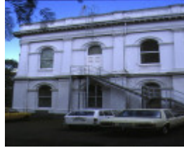
Royal Society Of Victoria Victoria Street Melbourne Rear View Oct 1986