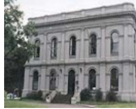
h00373 royal society view 2003