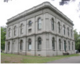
ROYAL SOCIETY OF VICTORIA SOHE 2008