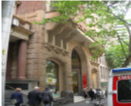
QUEENSLAND BUILDING SOHE 2008