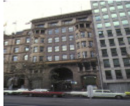
queensland building william street melbourne front view may1978