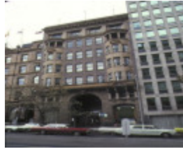
queensland building william street melbourne front view may1978