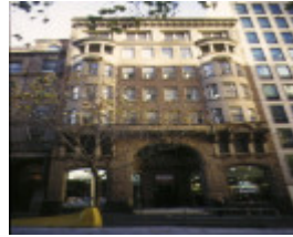
1 queensland house william street melbourne front elevation jun1997