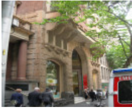
QUEENSLAND BUILDING SOHE 2008