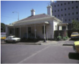
former royal mint williams street melbourne caretaker's cottage feb1985