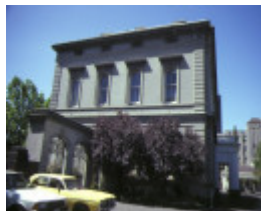
1 former royal mint williams street melbourne side view feb1985