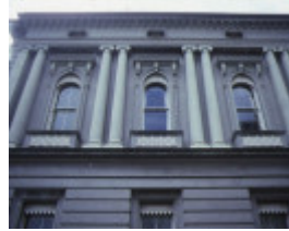
former royal mint williams street melbourne detail of front windows sep1985