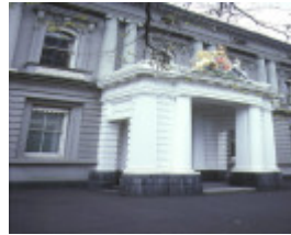
former royal mint williams street melbourne front entrance sep1985