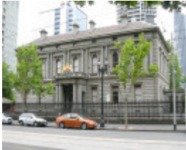
FORMER ROYAL MINT SOHE 2008