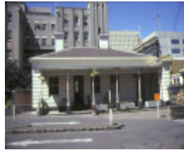
former royal mint williams street melbourne guard house feb1985