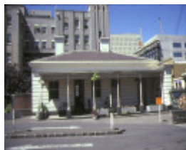
former royal mint williams street melbourne guard house feb1985