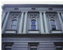
former royal mint williams street melbourne detail of front windows sep1985