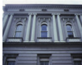
former royal mint williams street melbourne detail of front windows sep1985