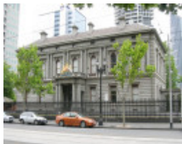
FORMER ROYAL MINT SOHE 2008