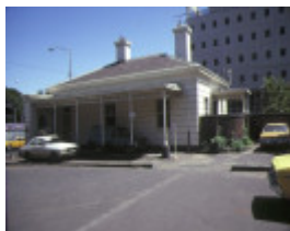
former royal mint williams street melbourne caretaker's cottage feb1985