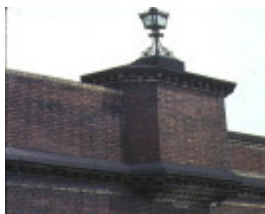
former royal mint williams street melbourne light on surrounding wall