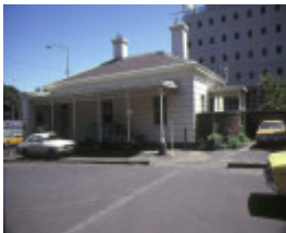
former royal mint williams street melbourne caretaker's cottage feb1985