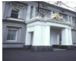
former royal mint williams street melbourne front entrance sep1985