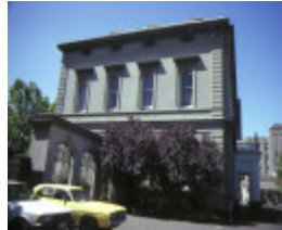
1 former royal mint williams street melbourne side view feb1985