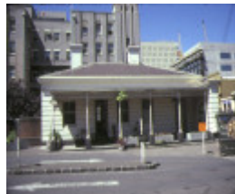
former royal mint williams street melbourne guard house feb1985