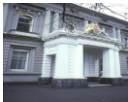
former royal mint williams street melbourne front entrance sep1985