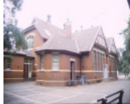
primary school no 2815 richardson street middle park infant school side view feb 1998