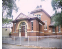
1 primary school no 2815 richardson street middle park infant school front view feb1998