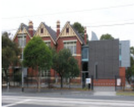
PRIMARY SCHOOL NO.2815 SOHE 2008