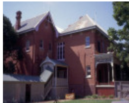
h00729 rio vista currton avenue mildura back corner she project 2003