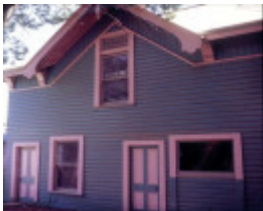
h00729 rio vista currton avenue mildura miner's cottage she project 2003