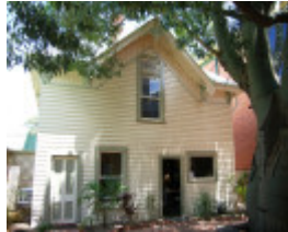
RIO VISTA SOHE 2008