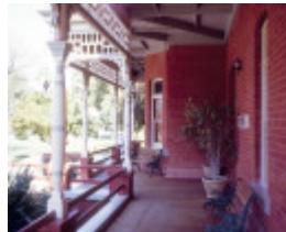
h00729 rio vista currton avenue mildura verandah she project 2003