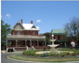
RIO VISTA SOHE 2008