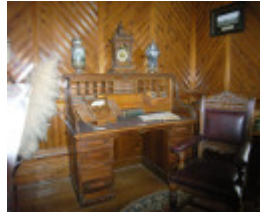
RIO VISTA SOHE 2008