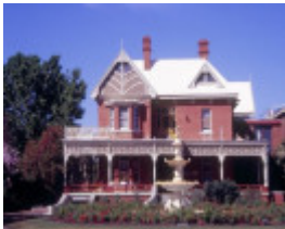
h00729 1 rio vista currton avenue mildura front she project 2003