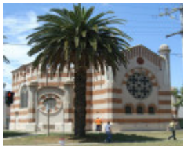
METHODIST CHURCH SOHE 2008