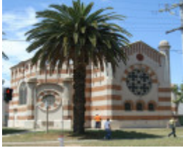
METHODIST CHURCH SOHE 2008