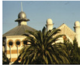
methodist church cnr deakin avenue & tenth street mildura view of roof line jun1980