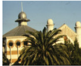
methodist church cnr deakin avenue & tenth street mildura view of roof line jun1980