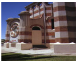
methodist church cnr deakin avenue & tenth street mildura rear entrance nov1989