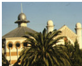
methodist church cnr deakin avenue & tenth street mildura view of roof line jun1980