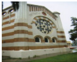
methodist church cnr deakin avenue & tenth street mildura exterior window sep1992