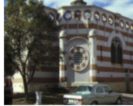
1 methodist church cnr deakin avenue & tenth street mildura side view