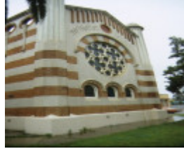
methodist church cnr deakin avenue & tenth street mildura exterior window sep1992