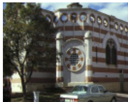
1 methodist church cnr deakin avenue & tenth street mildura side view