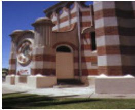
methodist church cnr deakin avenue & tenth street mildura rear entrance nov1989