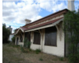
MINYIP RAILWAY STATION SOHE 2008