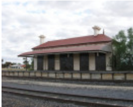
MINYIP RAILWAY STATION SOHE 2008