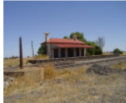
Minyip Railway Station February 2006