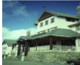
mount buffalo chalet front view