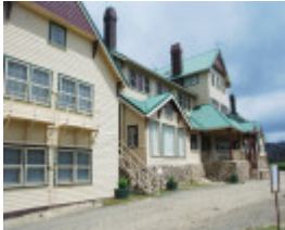
MOUNT BUFFALO CHALET SOHE 2008