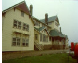
1 mount buffalo chalet front view oct00