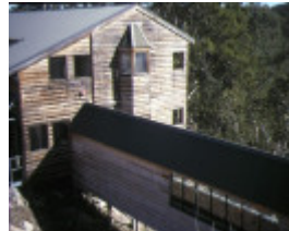
mount buffalo chalet outbuilding