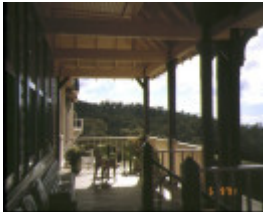
mount buffalo chalet verandah view