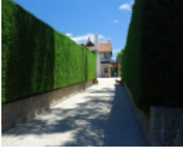
MARATHON SOHE 2008