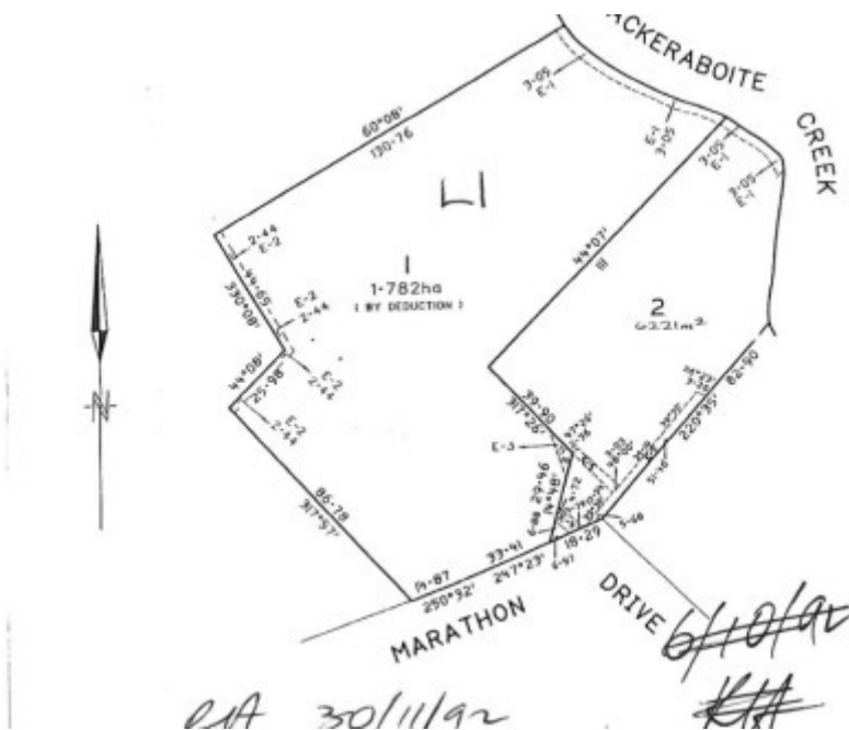
H0946 marathon plan a