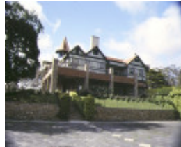
marathon marathon drive mt eliza repainted rear view