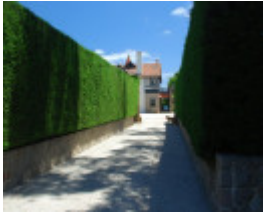
MARATHON SOHE 2008