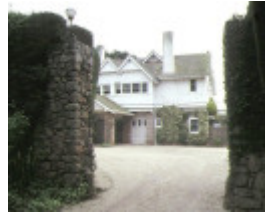
1 marathon marathon drive mt eliza driveway & entrance