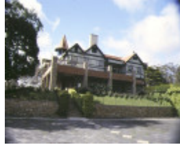
marathon marathon drive mt eliza repainted rear view