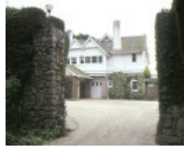
1 marathon marathon drive mt eliza driveway & entrance