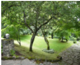
ALTON SOHE 2008