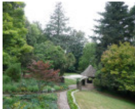
ALTON SOHE 2008