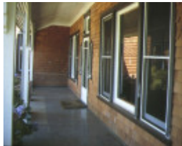
alton alton road mount macedon verandah