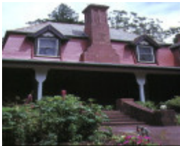
1 alton alton road mount macedon front view dec1990