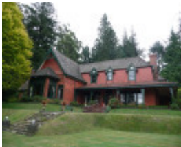
ALTON SOHE 2008