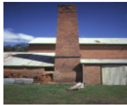
day's four mill complex murchison chimney nov1984