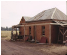
day's flour mill complex murchison gate lodge