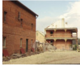
1 day's flour mill complex murchison mill & homestead