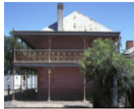
day's flour mill complex murchison side view of homestead