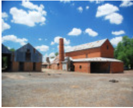
DAY'S FLOUR MILL COMPLEX SOHE 2008