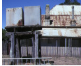
day's flour mill complex murchison corrugated iron building