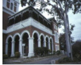
1 dhurringile prison murchison entrance aug1984