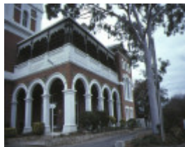
1 dhurringile prison murchison entrance aug1984