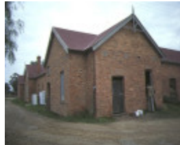
dhurringile prison murchison stables aug1984