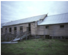
dhurringile prison murchison woolshed side view aug1984