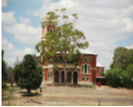
DHURRINGILE SOHE 2008