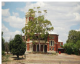
DHURRINGILE SOHE 2008