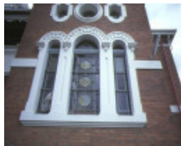
dhurringile prison murchison detail of window aug1984