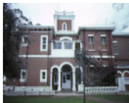
dhurringile prison murchison side view aug1984