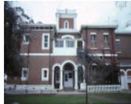
dhurringile prison murchison side view aug1984