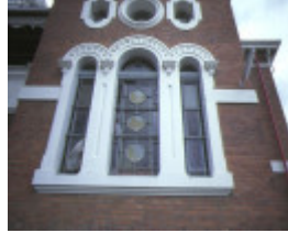
dhurringile prison murchison detail of window aug1984