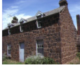
1 cameron hill bannockburn front view