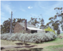
cameron hill bannockburn side view