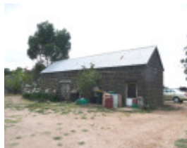
CAMERON HILL SOHE 2008