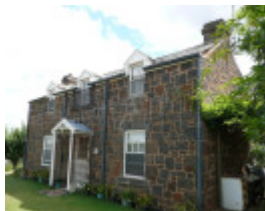
CAMERON HILL SOHE 2008