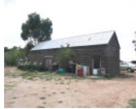
CAMERON HILL SOHE 2008