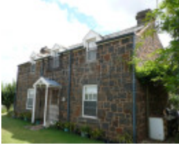
CAMERON HILL SOHE 2008