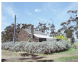
Cameron Hill Bannockburn side view