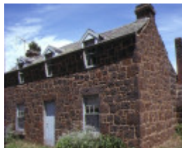
1 Cameron Hill Bannockburn front view