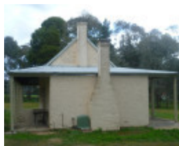
Before Photograph - Reference F3875 2014