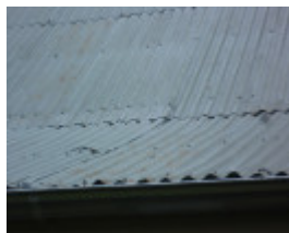
Before Photograph - Reference F3875 2014