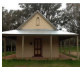
After Photograph - Reference F3875 2016