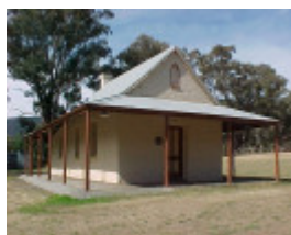
1 old school murrumbidgee nov99