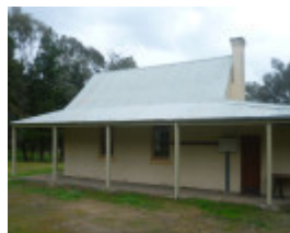
Before Photograph - Reference F3875 2014