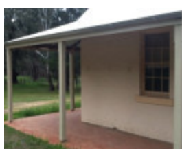
After Photograph - Reference F3875 2016