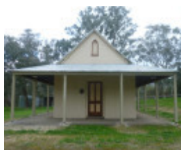
Before Photograph - Reference F3875 2014