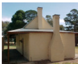
old school murrumbidgee rear nov99