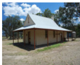
OLD SCHOOL SOHE 2008