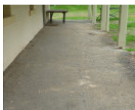
Before Photograph - Reference F3875 2014