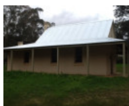
After Photograph - Reference F3875 2016