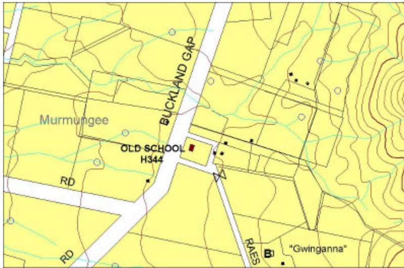
old school murmungee location