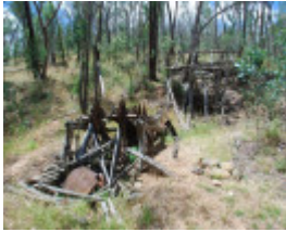
WATER WHEEL AND MINE MACHINERY SOHE 2008