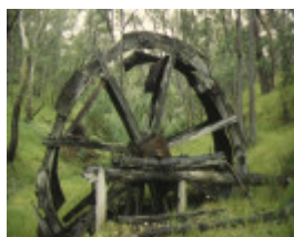
1 wells battery weon mine cunningham gully murmungee side elevation