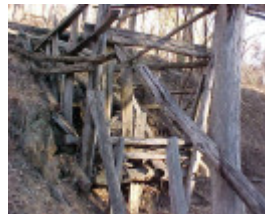
H00356 wells battery murmungee5 apr03 pm1