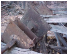
H00356 wells battery murmungee6 apr03