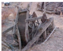
H00356 wells battery weon mine cunningham gully murmungee2 april2003