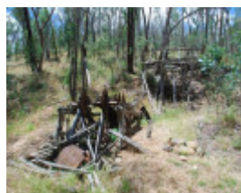
WATER WHEEL AND MINE MACHINERY SOHE 2008