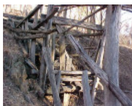
H00356 wells battery murmungee5 apr03 pm1