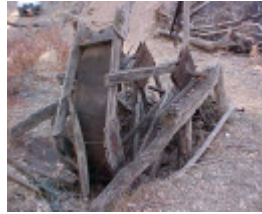
H00356 wells battery weon mine cunningham gully murmungee2 april2003