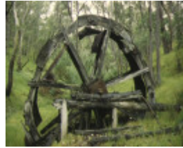
1 wells battery weon mine cunningham gully murmungee side elevation