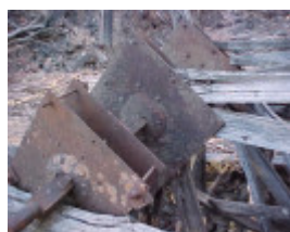
H00356 wells battery murmungee6 apr03