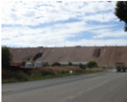
MARMALAKE/MURTOA GRAIN STORE SOHE 2008