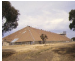
murtoa grain store wimmera hwy murtoa site view