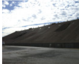
MARMALAKE/MURTOA GRAIN STORE SOHE 2008