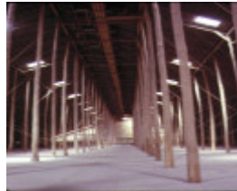
murtoa grain store wimmera hwy murtoa interior from ground view