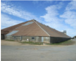
MARMALAKE/MURTOA GRAIN STORE SOHE 2008