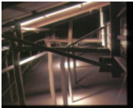
murtoa grain store wimmera hwy murtoa interior rafters