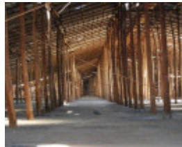
Murtoa Grain Store interior Nov 08 01