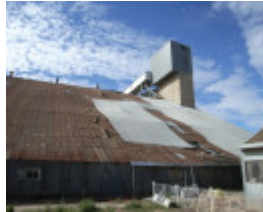
MARMALAKE/MURTOA GRAIN STORE SOHE 2008