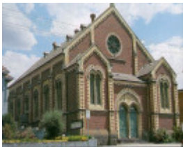
baptist church aberdeen street newtown front elevation publication