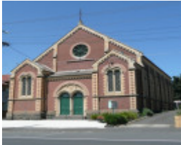
BAPTIST CHURCH SOHE 2008