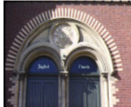
baptist church aberdeen street newtown detail entrance