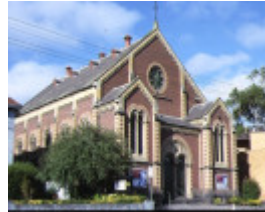
1 baptist church aberdeen street newtown front view