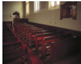
baptist church aberdeen street newtown interior sep1977