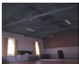
former baptist church aberdeen street newtown interior