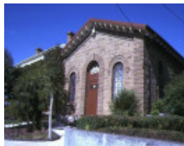
former baptist church aberdeen street newtown chapel front view