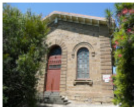
FORMER BAPTIST CHURCH SOHE 2008