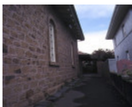
former baptist church aberdeen street newtown side view