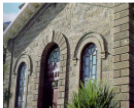
former baptist church aberdeen street newtown front elevation publication