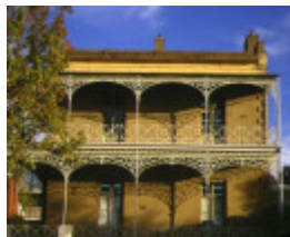
armytage house pakington street newtown side view 1997