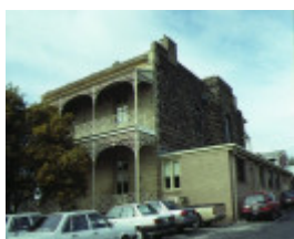
armytage house pakington street newtown rear view