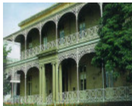
armytage house pakington street newtown front elevation publication