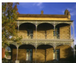
armytage house pakington street newtown side view 1997