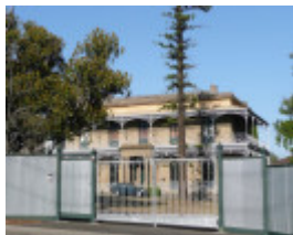
ARMYTAGE HOUSE SOHE 2008