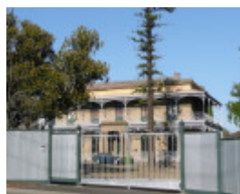
ARMYTAGE HOUSE SOHE 2008