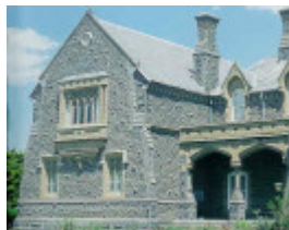
sacred heart convent & college reatreat road newtown front elevation publication