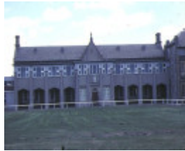
sacred heart convent & college retreat rd newtown rear building