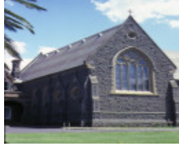
sacred heart convent & college retreat rd newtown chapel front