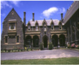
sacred heart convent & college retreat rd newtown entrance