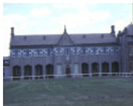
sacred heart convent & college retreat rd newtown rear building