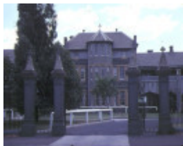
1 sacred heart convent & college retreat rd newtown front view