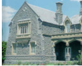
sacred heart convent & college reatreat road newtown front elevation publication