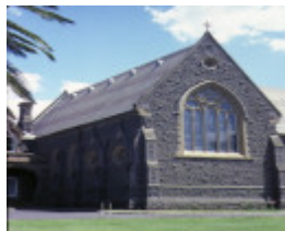
sacred heart convent & college retreat rd newtown chapel front