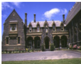
sacred heart convent & college retreat rd newtown entrance