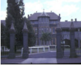
1 sacred heart convent & college retreat rd newtown front view