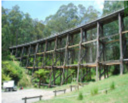
RAIL BRIDGE SOHE 2008