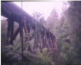
rail bridge noojee side elevation