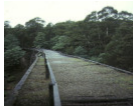
rail bridge noojee top view may1990