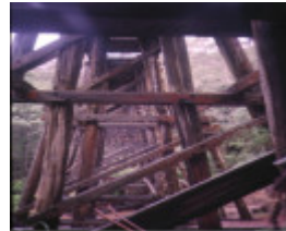
rail bridge noojee trestle view