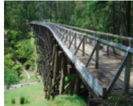
RAIL BRIDGE SOHE 2008