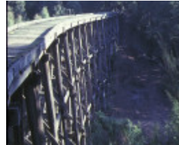
1 rail bridge noojee side view aug1982