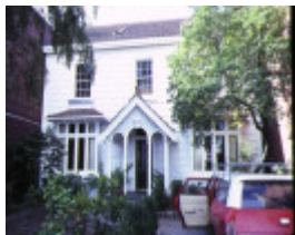
1 456 victoria street nth melb front view