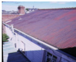
456 victoria street nth melb roof back