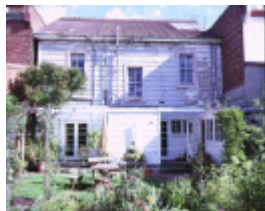
456 victoria street nth melb back view