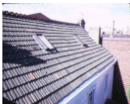
456 victoria street nth melb roof front