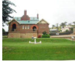
OMEO JUSTICE PRECINCT SOHE 2008