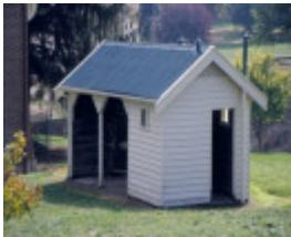
h01536 omeo justice precinct day avenue omeo magistrates stable