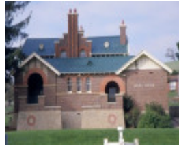
h01536 1 omeo justice precinct day avenue omeo 1893 courthouse from day avenue