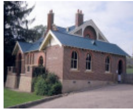
h01536 omeo justice precinct day avenue omeo 1893 courthouse western side