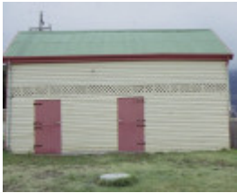
log lock up & hut omeo police stables