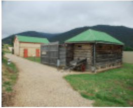
OMEO JUSTICE PRECINCT SOHE 2008