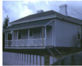
log lock up & hut omeo police station