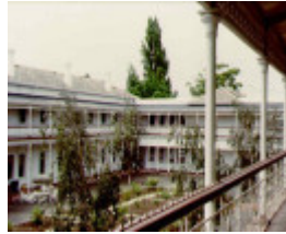
1 mount royal geriatric hospital poplar road parkville courtyard jul1998