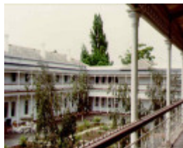
1 mount royal geriatric hospital poplar road parkville courtyard jul1998