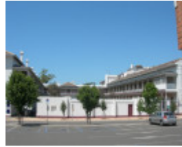
NORTH WEST HOSPITAL, PARKVILLE CAMPUS SOHE 2008