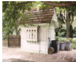
mount royal geriatric hospital poplar road parkville gate house jan1998