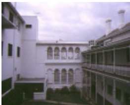
mount royal geriatric hospital poplar road parkville wing jul1998