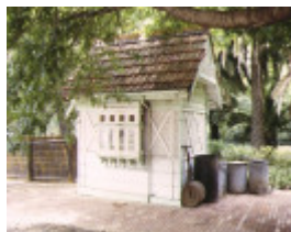
mount royal geriatric hospital poplar road parkville gate house jan1998