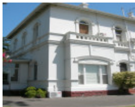
NORTH WEST HOSPITAL, PARKVILLE CAMPUS SOHE 2008