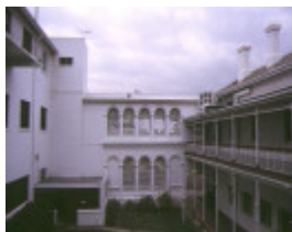
mount royal geriatric hospital poplar road parkville wing jul1998