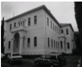
mount royal geriatric hospital poplar road parkville &w entry extension