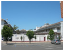
NORTH WEST HOSPITAL, PARKVILLE CAMPUS SOHE 2008