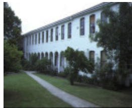
mount royal geriatric hospital poplar road parkville women's division dec1985