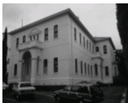
mount royal geriatric hospital poplar road parkville b&w entry extension