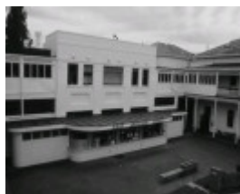
mount royal geriatric hospital poplar road parkville b&w kiosk