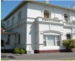
NORTH WEST HOSPITAL, PARKVILLE CAMPUS SOHE 2008