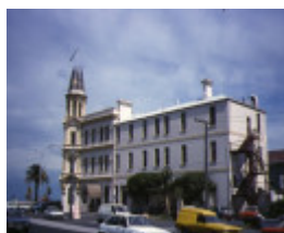
hotel victoria beaconsfield parade albert park side view