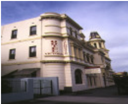
hotel victoria beaconsfield parade albert park side elevation