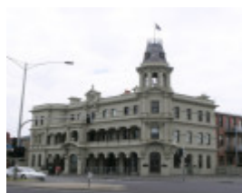
HOTEL VICTORIA SOHE 2008