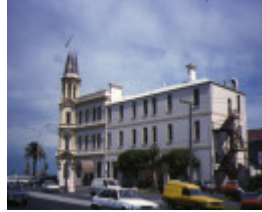
hotel victoria beaconsfield parade albert park side view