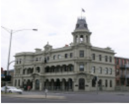
HOTEL VICTORIA SOHE 2008