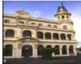
1 hotel victoria beaconsfield parade albert park front elevation