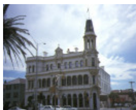
hotel victoria beaconsfield parade albert park front view