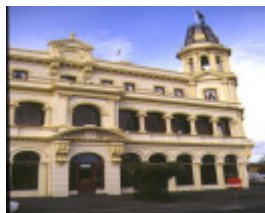
1 hotel victoria beaconsfield parade albert park front elevation