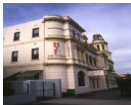
hotel victoria beaconsfield parade albert park side elevation