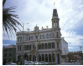
hotel victoria beaconsfield parade albert park front view