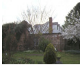
former travellers rest inn batesford side view oct1985