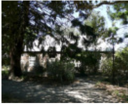
FORMER TRAVELLERS REST INN SOHE 2008