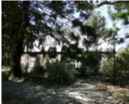
FORMER TRAVELLERS REST INN SOHE 2008