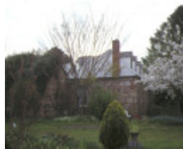
former travellers rest inn batesford side view oct1985