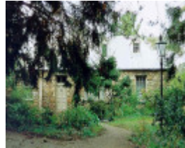
former travellers rest inn batesford front elevation publication