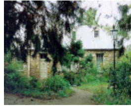
former travellers rest inn batesford front elevation publication