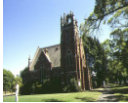
1 presbyterian college church royal prd parkville front view jan1997