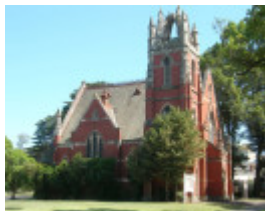
FORMER COLLEGE CHURCH SOHE 2008