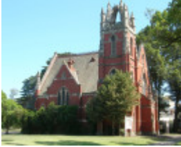
FORMER COLLEGE CHURCH SOHE 2008