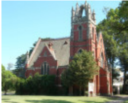
FORMER COLLEGE CHURCH SOHE 2008