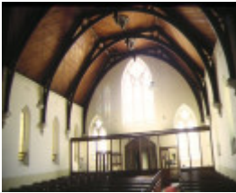
presbyterian college church royal prd parkville interior back jan1997