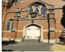
presbyterian college church royal prd parkville detail front entrance jan1997