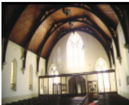
presbyterian college church royal prd parkville interior back jan1997