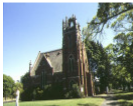
1 presbyterian college church royal prd parkville front view jan1997