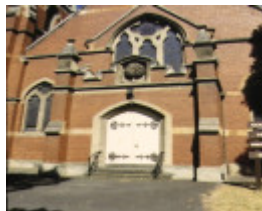
presbyterian college church royal prd parkville detail front entrance jan1997