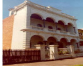
1 selvetta the avenue parkville front view