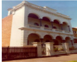
1 selvetta the avenue parkville front view