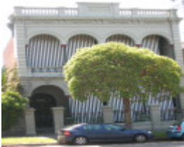
SELVETTA SOHE 2008