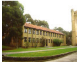
newman college university of melb kenny wing sw jun1999