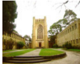
newman college university of melb entry chapel sw jun1999