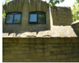
NEWMAN COLLEGE SOHE 2008