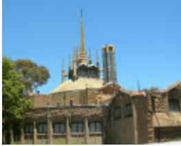
NEWMAN COLLEGE SOHE 2008