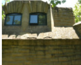
NEWMAN COLLEGE SOHE 2008