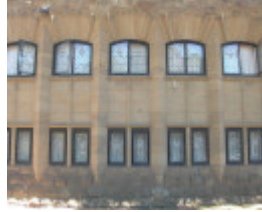
NEWMAN COLLEGE SOHE 2008