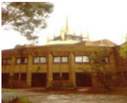
1 newman college university of melb dining hall sw jun1999