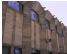
newman college university of melb side wall