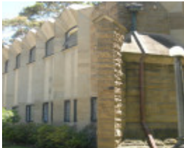
NEWMAN COLLEGE SOHE 2008