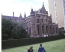
1 baldwin spencer building university of melbourne parkville front view