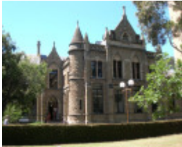
BALDWIN SPENCER BUILDING (OLD ZOOLOGY) SOHE 2008