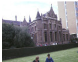
1 baldwin spencer building university of melbourne parkville front view