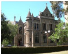
BALDWIN SPENCER BUILDING (OLD ZOOLOGY) SOHE 2008