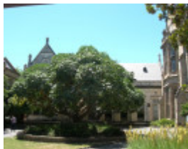
OLD PHYSICS CONFERENCE ROOM AND GALLERY SOHE 2008