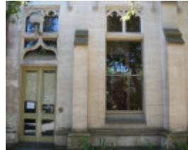
OLD PHYSICS CONFERENCE ROOM AND GALLERY SOHE 2008