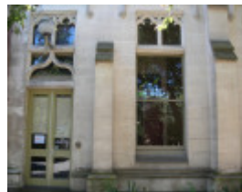
OLD PHYSICS CONFERENCE ROOM AND GALLERY SOHE 2008