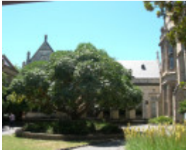
OLD PHYSICS CONFERENCE ROOM AND GALLERY SOHE 2008