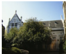
1 school of natural philosophy university of melbourne parkville front view