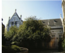
1 school of natural philosophy university of melbourne parkville front view