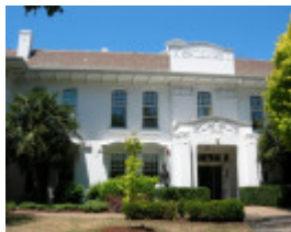
CONSERVATORIUM OF MUSIC AND MELBA HALL SOHE 2008