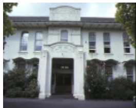
1 conservatorium of music & melba hall university of melbourne parkville front view mar1979