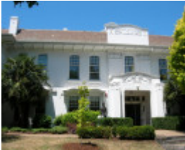
CONSERVATORIUM OF MUSIC AND MELBA HALL SOHE 2008