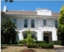
CONSERVATORIUM OF MUSIC AND MELBA HALL SOHE 2008