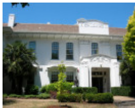
CONSERVATORIUM OF MUSIC AND MELBA HALL SOHE 2008