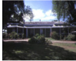
1 wentworth house pascoe vale south front view