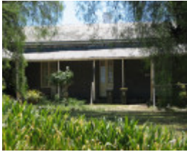
WENTWORTH HOUSE SOHE 2008