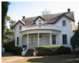
MULBERRY HILL SOHE 2008