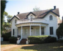
MULBERRY HILL SOHE 2008