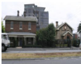
PORT MELBOURNE COURT HOUSE, POLICE STATION AND LOCK-UP SOHE 2008