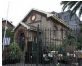
PORT MELBOURNE COURT HOUSE, POLICE STATION AND LOCK-UP SOHE 2008