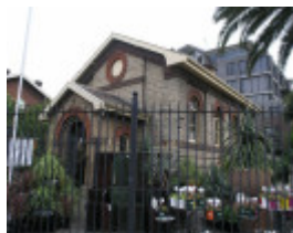
PORT MELBOURNE COURT HOUSE, POLICE STATION AND LOCK-UP SOHE 2008