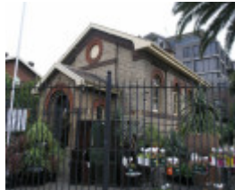
PORT MELBOURNE COURT HOUSE, POLICE STATION AND LOCK-UP SOHE 2008