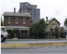
PORT MELBOURNE COURT HOUSE, POLICE STATION AND LOCK-UP SOHE 2008