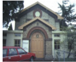
1 port melbourne courthouse policew station & lock up bay street port melbourne front view courthouse