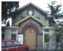
1 port melbourne courthouse police station & lock up bay street port melbourne front view courthouse