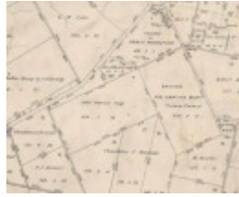
1878 Crown Lands survey.jpg