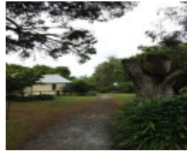
Approach to homestead (2017).jpg