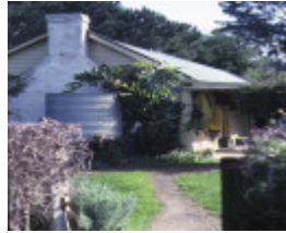
eurutta sages rd baxter homestead side view