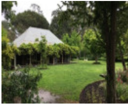
Homestead, east wing (2017).jpg