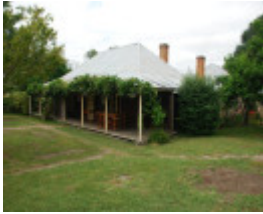
SAGES COTTAGE SOHE 2008