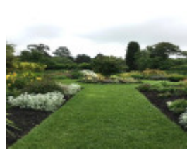
Gardens, east of homestead (2017).jpg