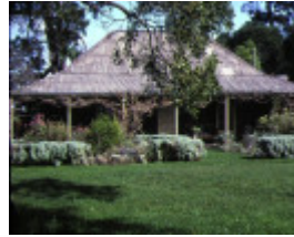
1 eurutta sages rd baxter front view homestead