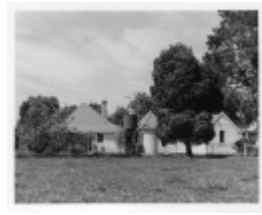
Homestead east side (1972).jpg