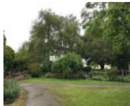
Peppercorn tree (2017).jpg