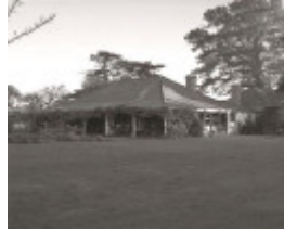
Homestead, looking south (nd).jpg