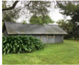
Outdoor toilet (2017).jpg