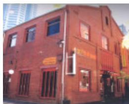
Former Stables as Restaurant