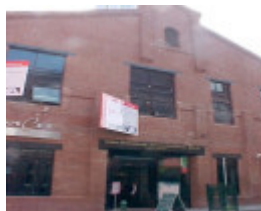
Former Angliss Stables May 2003