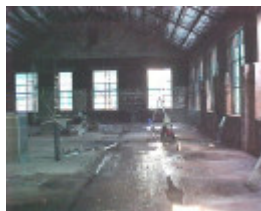
Former Angliss Stables December 2002