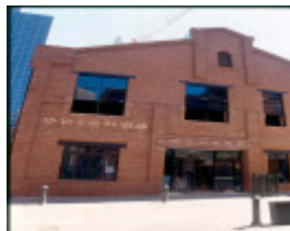
H02028 former angliss stables little bourke st melbourne dec 2002 h2028