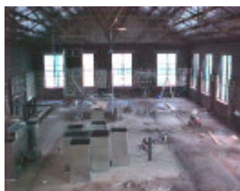
Former Angliss Stables December 2002