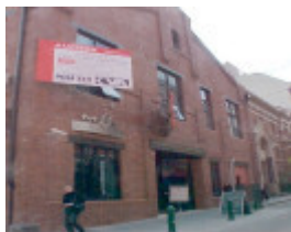
Former Angliss Stables May 2003