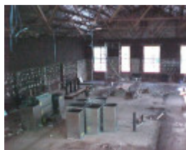
Former Angliss Stables December 2002