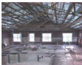
Former Angliss Stables December 2002