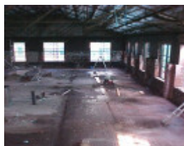
Former Angliss Stables December 2002