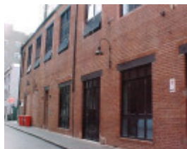
Former Angliss Stables May 2003