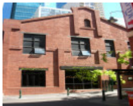
FORMER ANGLISS & CO STABLES SOHE 2008