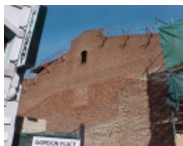
Former Angliss Stables December 2002