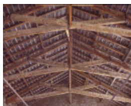
h00389 portarlington mill turner crt portarlington scissor beam construction under roof she project 2003