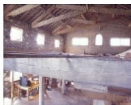
h00389 portarlington mill turner crt portarlington top floor north end she project 2003