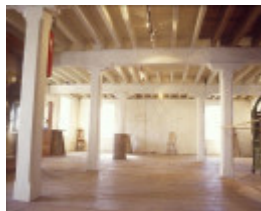
h00389 portarlington mill turner crt portarlington first floor construction she project 2003