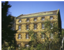
1 portarlington mill turner court portarlington front view mar1997