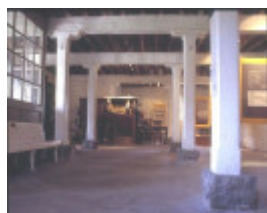
h00389 portarlington mill turner crt portarlington ground floor she project 2003