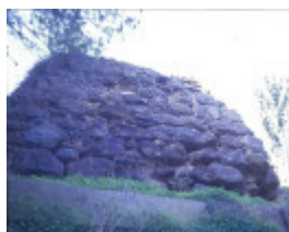
h00389 portarlington mill turner crt portarlington remains of rear boiler house she project 2003