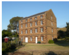
PORTARLINGTON MILL SOHE 2008