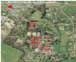
Mayday Hills building references