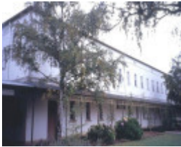
h01189 mayday hills hospital albert rd beechworth female wing