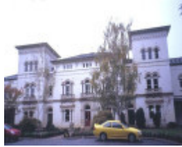
h01189 1 mayday hills hospital albert rd beechworth administration building