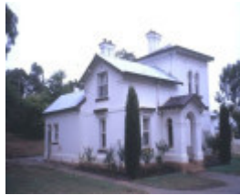
h01189 mayday hills hospital albert rd beechworth gatehouse