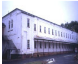
h01189 mayday hills hospital albert rd beechworth male wing