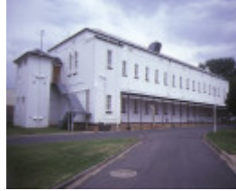
mayday hills hospital albert street beechworth rear view dec1984