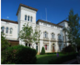
MAYDAY HILLS HOSPITAL SOHE 2008