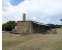
GLENAMPLE HOMESTEAD SOHE 2008