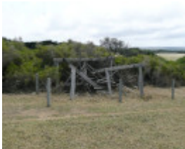
GLENAMPLE HOMESTEAD SOHE 2008