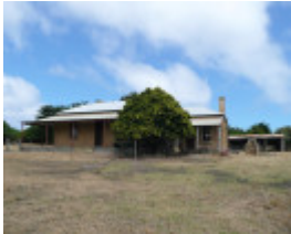
GLENAMPLE HOMESTEAD SOHE 2008