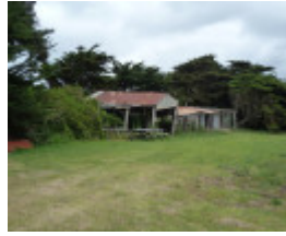
H0392 GLENAMPLE HOMESTEAD LHA 2015 7.JPG