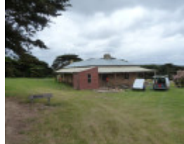
H0392 GLENAMPLE HOMESTEAD LHA 2015 1.JPG