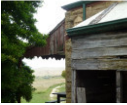
H0392 GLENAMPLE HOMESTEAD LHA 2015 5.JPG