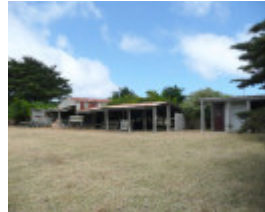
GLENAMPLE HOMESTEAD SOHE 2008