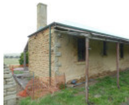
H0392 GLENAMPLE HOMESTEAD LHA 2015 4.JPG