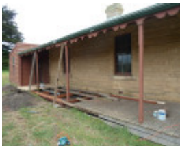
H0392 GLENAMPLE HOMESTEAD LHA 2015 2.JPG