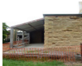
H0392 GLENAMPLE HOMESTEAD LHA 2015 3.JPG