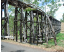
RAIL BRIDGE SOHE 2008