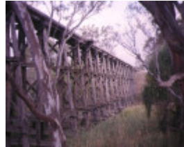
1 rail bridge over mollisons creek pyalong side elevation apr1995