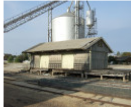
PYRAMID HILL RAILWAY STATION SOHE 2008