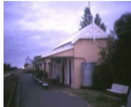
1 pyramid hill railway station wandong bendigo line side view apr 95