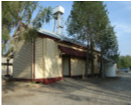
PYRAMID HILL RAILWAY STATION SOHE 2008