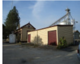
PYRAMID HILL RAILWAY STATION SOHE 2008