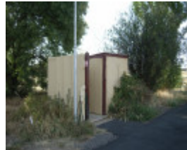
PYRAMID HILL RAILWAY STATION SOHE 2008