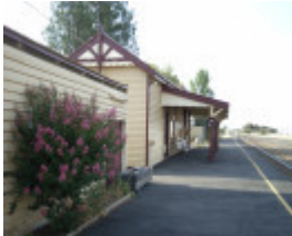
PYRAMID HILL RAILWAY STATION SOHE 2008