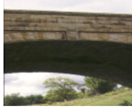
newtown bridge precinct beechworth detail of bridge arch & keystone