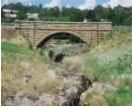
NEWTOWN BRIDGE PRECINCT SOHE 2008