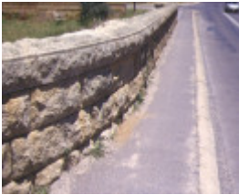
newtown bridge precinct beechworth side wall of bridge