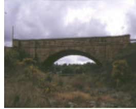
newtown bridge precinct beechworth side elevation